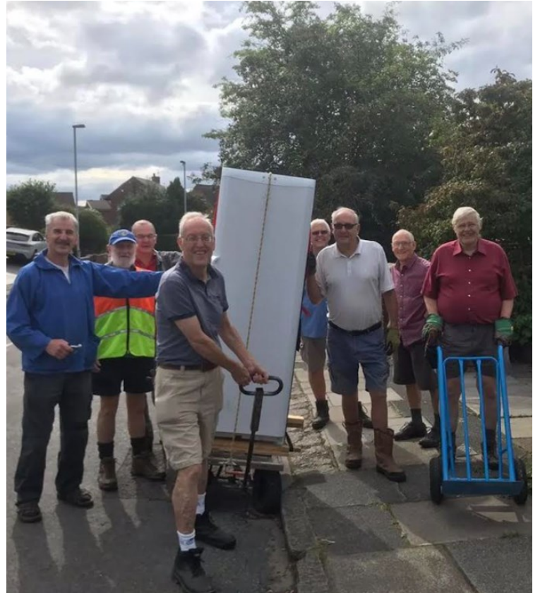
The Holy Toast Café fridge on the way to church - thanks chaps

Welcome to our service of Holy Communion on the Twelfth Sunday after Trinity. Our hymns this morning are: